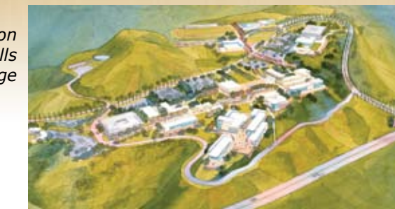
Crafton Hills College