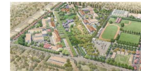
San Bernardino Valley College